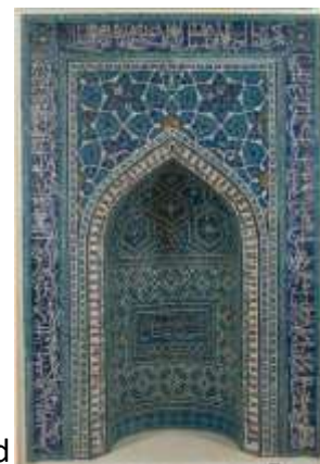
Example of a Mihrab

The Imam , who is a person who leads congregational prayers in a mosque and provides religious guidance, gave the children a guided tour of the mosque. He showed them where he sits during a prayer session and the showed them the Mihrab , which is a decorative, concave niche in the wall of a mosque that indicates the direction of Mecca.