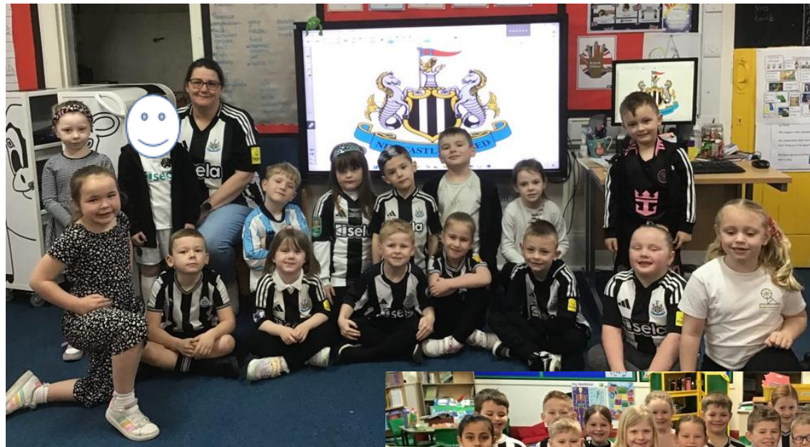
Black and White day In key stages 1 and 2